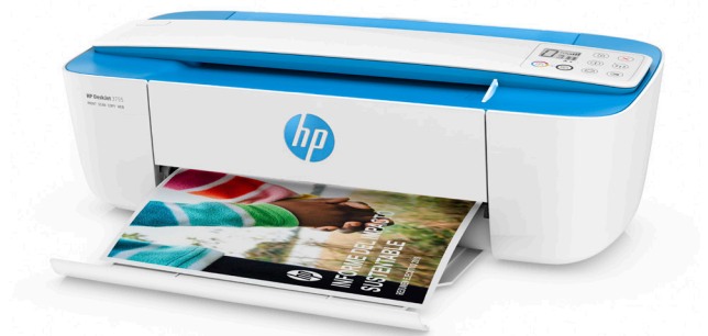
HP DeskJet 3755 All-in-One Printer J9V90A 975 points

Enroll now at hpbusinessrewards.com/join/WBMason to make your purchases go further. And earn 150 bonus points the first time you log in.